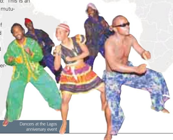
Dancers at the Lagos anniversary event