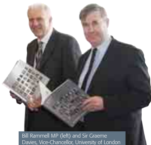
Bill Rammell MP (left) and Sir Graeme Davies, Vice-Chancellor, University of London

'Reinvention lies at the heart of the 150 years' success of the University of London External System,' said Bill Rammell MP, Minister of State, Department for Innovation, Universities and Skills. 'The External System continues to evolve in a way that keeps it relevant to new student needs. Through its activities, the University of London External System supports the Government's access