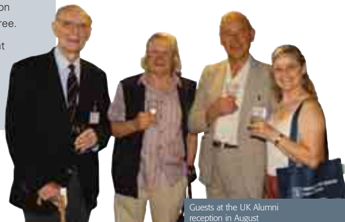
Guests at the UK Alumni reception in August