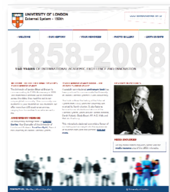
photo gallery. A specially commissioned anniversary book has been produced to commemorate the University of London External System's 150th Anniversary, details of which can be found on the microsite. www.londonexternal.ac.uk/150

In celebration of the External System's 150th Anniversary we've launched a 150th microsite. This provides a flavour of our history and an insight into the experiences of students both past and present. The site gives an overview of the External System's global community of former students and alumni, including some of the exceptional people who have made their mark on the world. As part of the celebrations we're also collecting memories and quotes from students, alumni and staff. We've already added some of these to the site and hope to add many more over the course of the year. Consequently, we'd like to invite you to share your own memories with us. If you have photos we can add them to the 150th